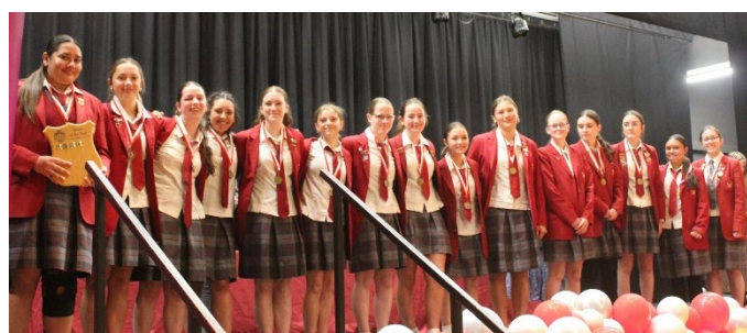
Hockey 1st XI