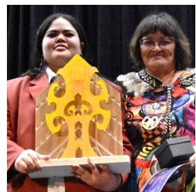
Hinerautekau Tamatea-Turi Rei Matariki Award

This award goes to a student who carries the mana of past pupils into the present, embodying the legacy of those who have walked the school before them. She upholds our school values in every aspect of her school life, exemplifying the essence of service, always giving back to the school community and nurturing an atmosphere of unity. She carries the torch of those who came before, lighting the way for generations to come.