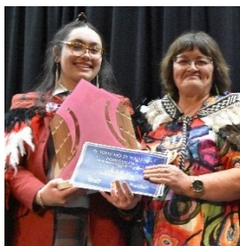
Arabella King Pohutukawa Award

This star serves as a reminder to reflect on the individuals who have enriched our lives and contributed to our journey.