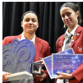
Rangitiare Graham Waitī/Waitā Award

These stars are both connected to water. Waitī is the star connected to fresh water that is essential for health and wellbeing and used for all manner of Māori ceremonies.